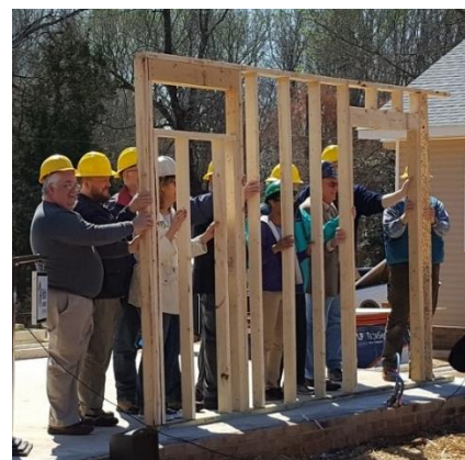
Wall-Raising Ceremony for Habitat House at 201 Boyd Street.