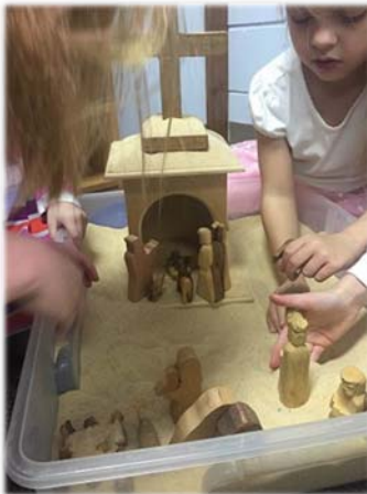
Exploring the desert